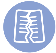
in the case of serious breaches, termination of employment, contract or engagement