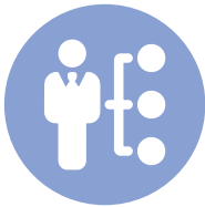
the restriction of duties